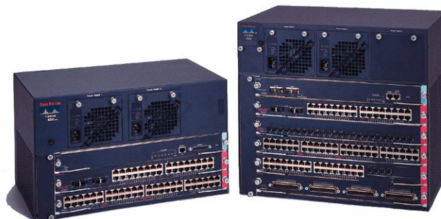
Figure 1: Cisco Catalyst 4003 and 4006