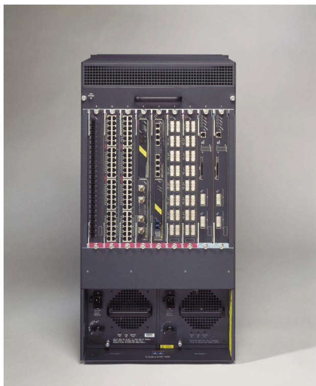
Figure 1 Cisco 7600 Optical Services Router

This application of scalable, high-speed IP services is enabled through the use of a unique Cisco processing technology, Parallel Express Forwarding (PXF). PXF is implemented in a new PXF IP Services Processor, which provides parallelized, pipelined IP packet processing with integrated application of high-touch IP services at rates up to 6 million packets per second (Mpps). These IP services processors (typically two) are deployed in a distributed fashion on each of a set of new linecards—Optical Services Modules (OSMs)—for the Cisco 7600 OSR (Figure 2).