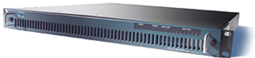
Cisco uMG9820 QAM Gateway